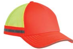
neon orange/neon yellow