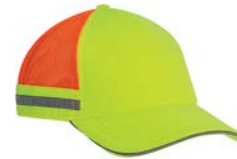
neon yellow/neon orange