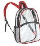
BE259 PVC BACKPACK