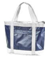
BE254 ALL WEATHER TOTE